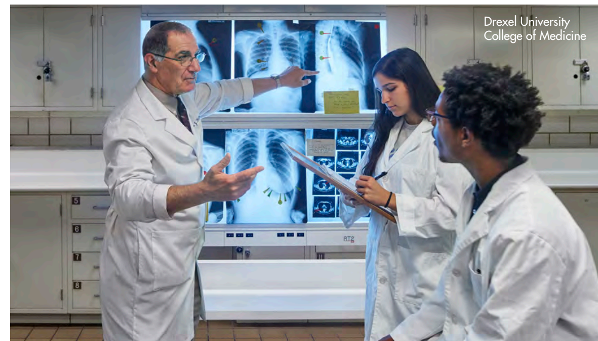
Drexel University College of Medicine