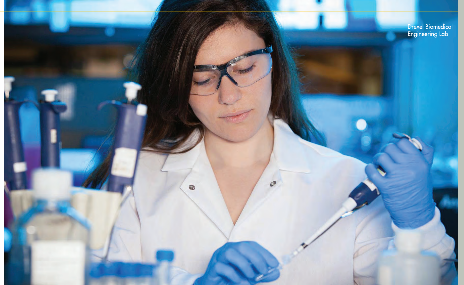
Drexel Biomedical Engineering Lab

A Drexel pre-health education will give you a competitive edge and a full résumé of work experience before you graduate; no other school can uniquely prepare you for your chosen industry in the way that Drexel's cooperative education can. Learn more about our opportunities for the pre-health professions at drexel.edu/academics .