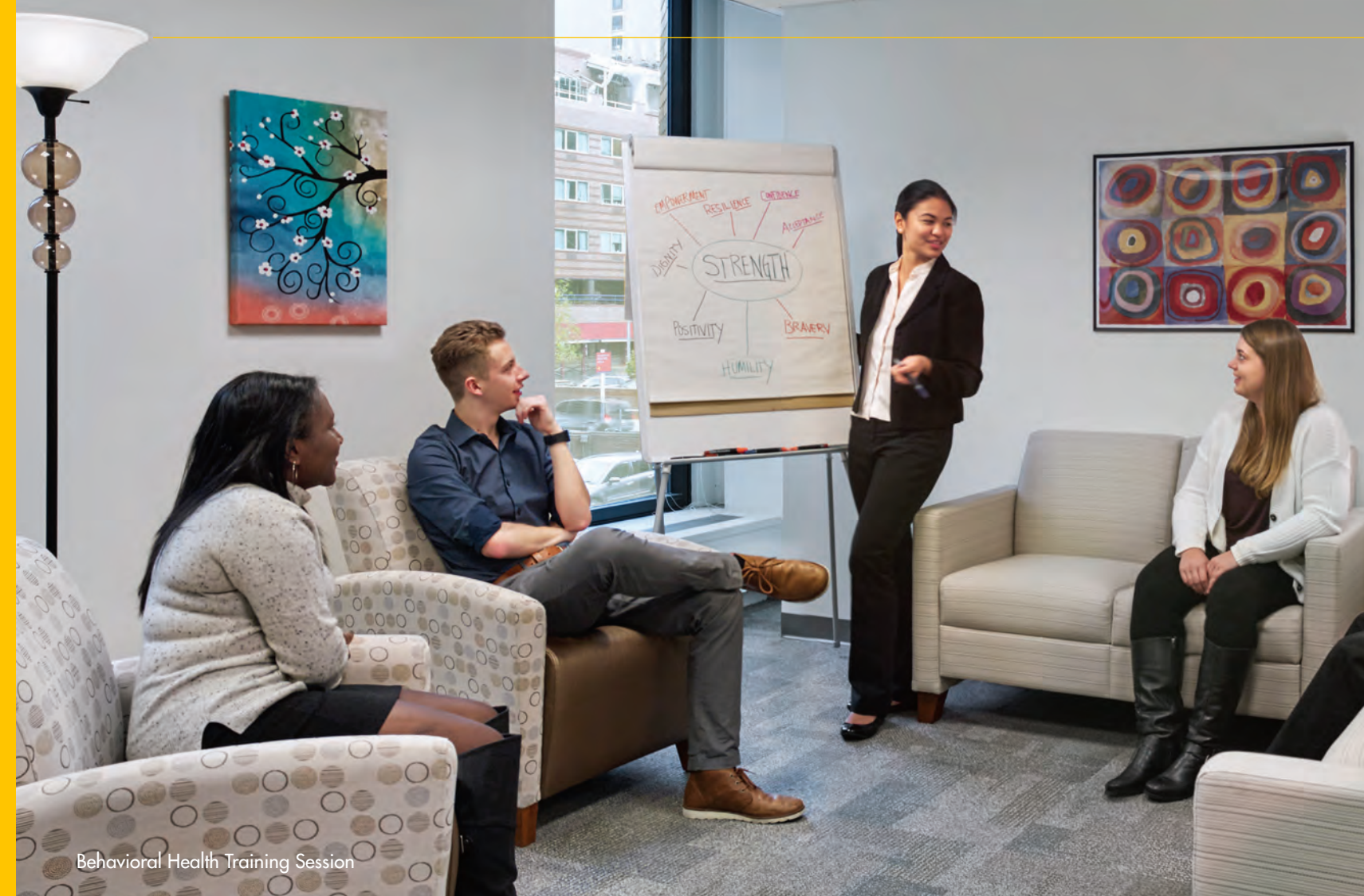
Behavioral Health Training Session