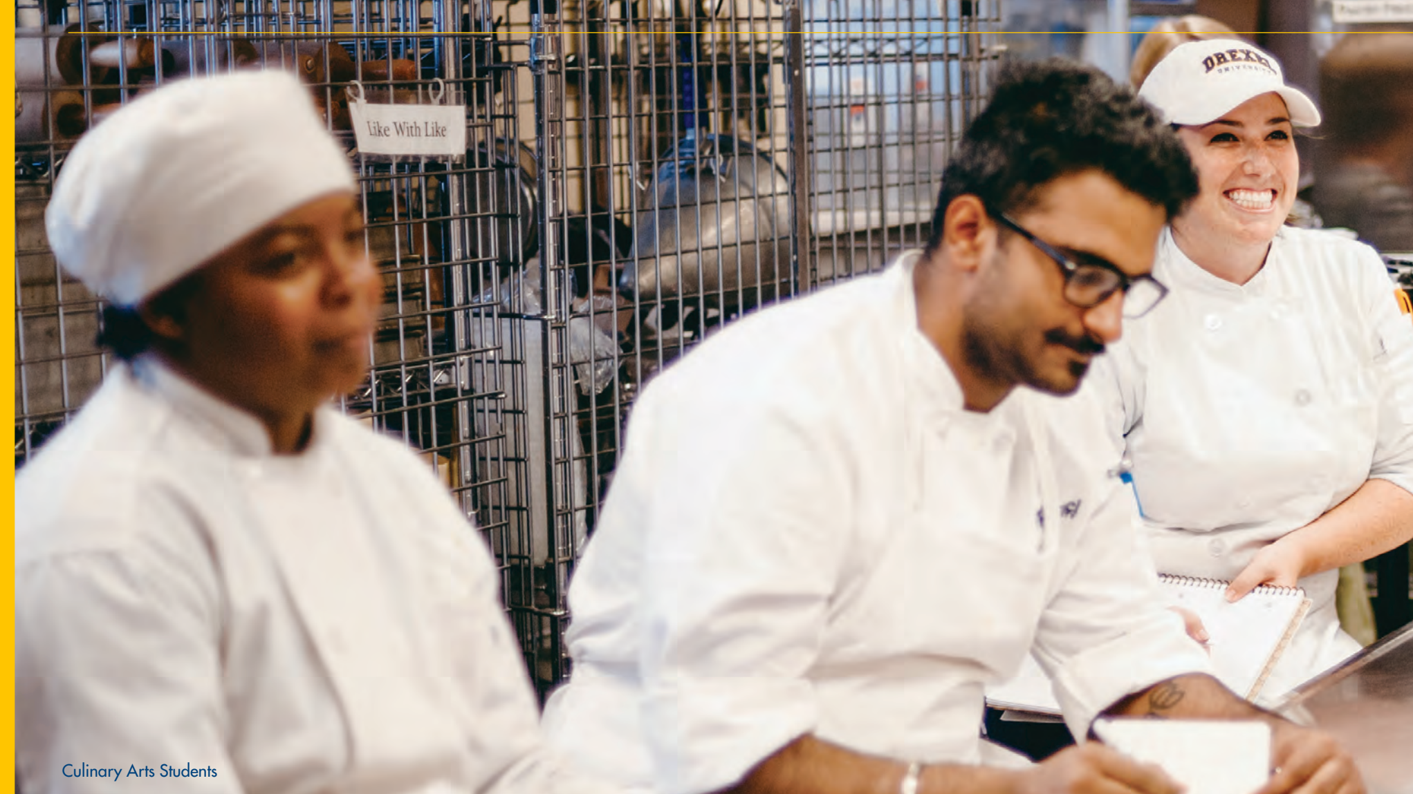
Culinary Arts Students