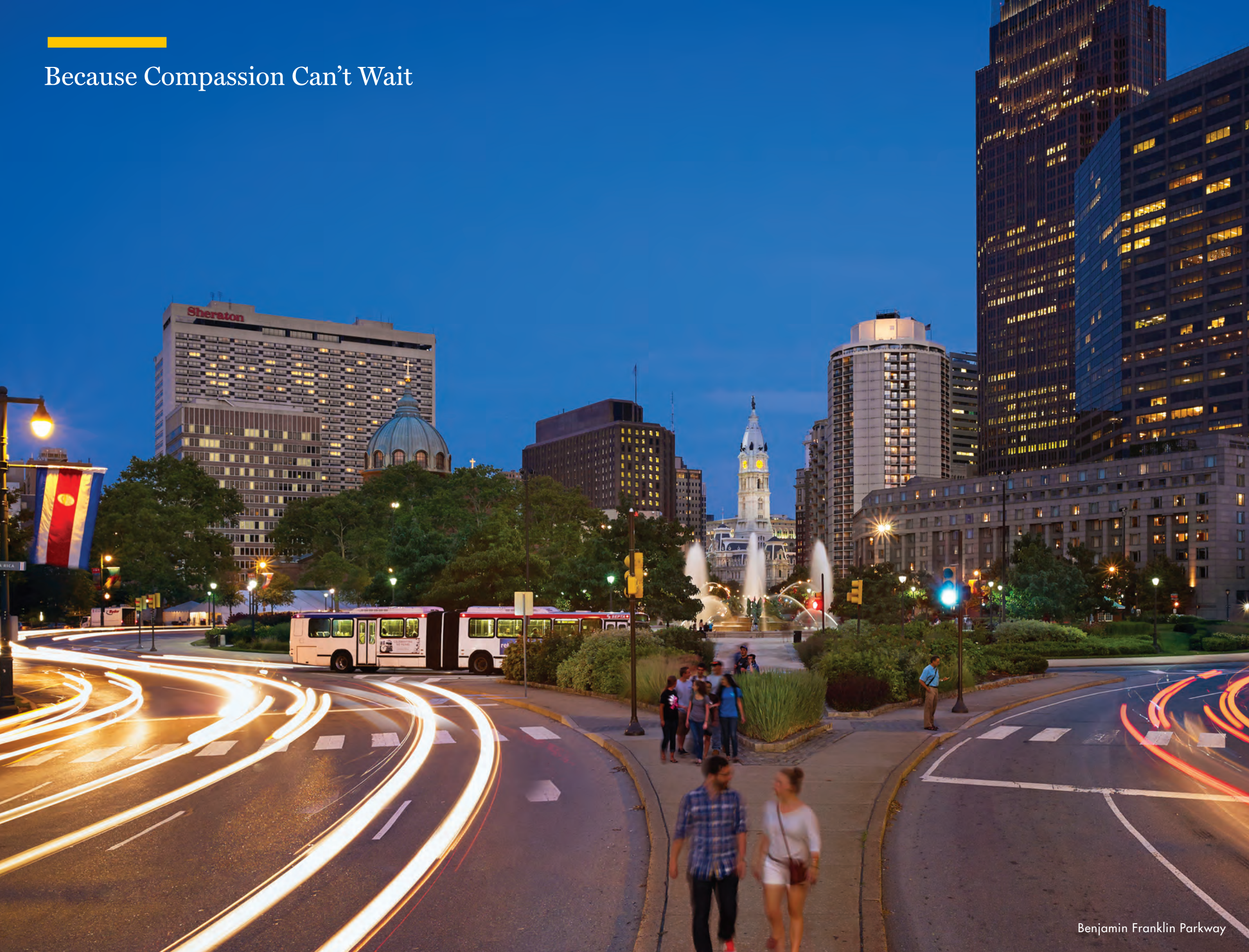
Benjamin Franklin Parkway