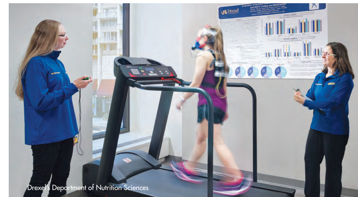
Drexel's Department of Nutrition Sciences

By the time you graduate and are ready to enter the workforce, you will have already built a résumé of real-world experience that will set you apart from your peers. At Drexel, you'll partner with the leaders of the industry to explore and shape the food culture of tomorrow. Learn more about our food sciences programs at drexel.edu/academics .