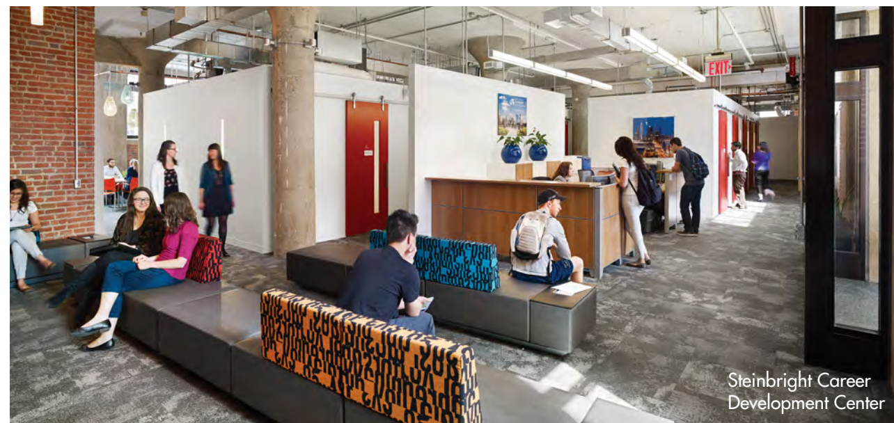
Steinbright Career Development Center