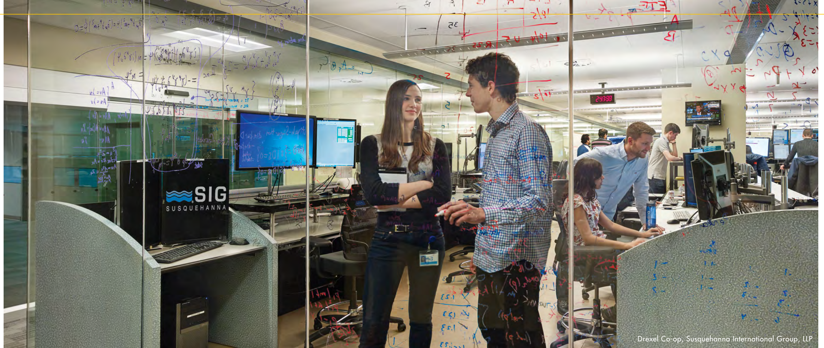
Drexel Co-op, Susquehanna International Group, LLP

The Steinbright Career Development Center, one of the largest collegiate co-op and career services teams in the world, sets you up for success at Drexel from day one. Whether you're looking for potential co-op employers, research opportunities, or post-graduate endeavors, Steinbright connects you to Drexel's constantly growing network of employers and industry leaders while also building your résumé and interview skills through workshops and information sessions. Our unique combination of world-class career services and dedicated counseling professionals will help guide you to discover your interests and develop your professional tools.