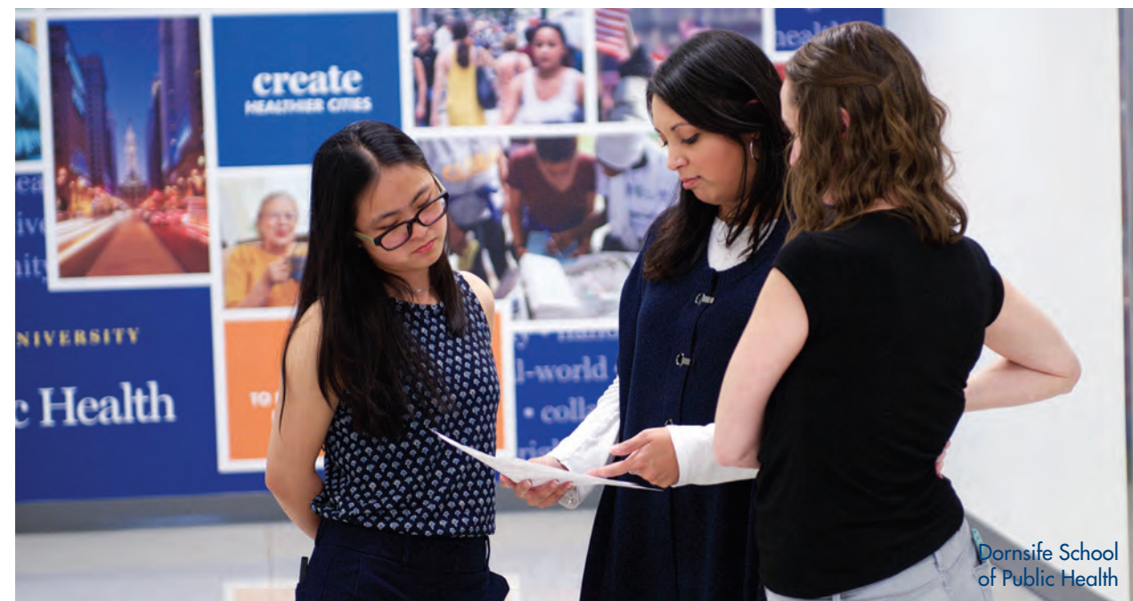
Dornsife School of Public Health

This combination of traditional learning, clinical, and hands-on experience, as well as community service, will not only prepare you to succeed after graduation but will allow you to hit the ground running in your respective industry. The next wave of health care revolution is here. Learn more about our Health Professions and Public Health programs at drexel.edu/academics .