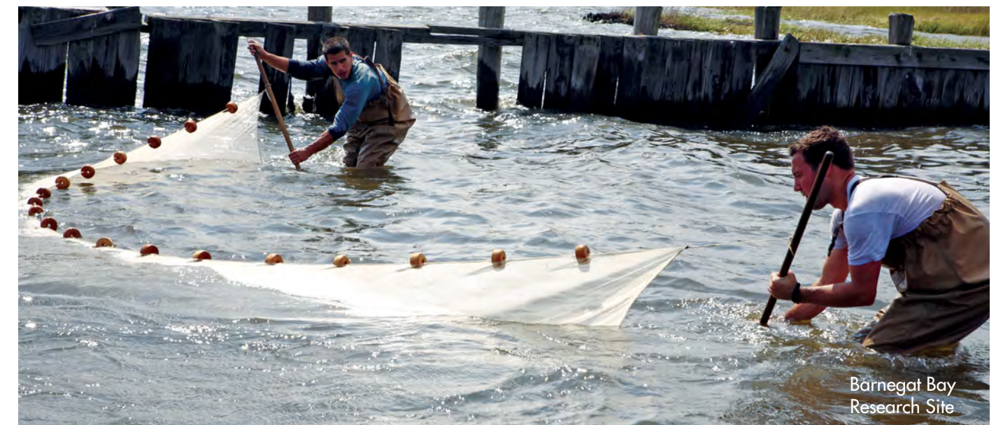
Barnegat Bay Research Site